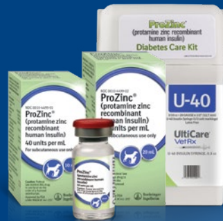
ProZinc ® (protamine zinc recombinant human insulin)